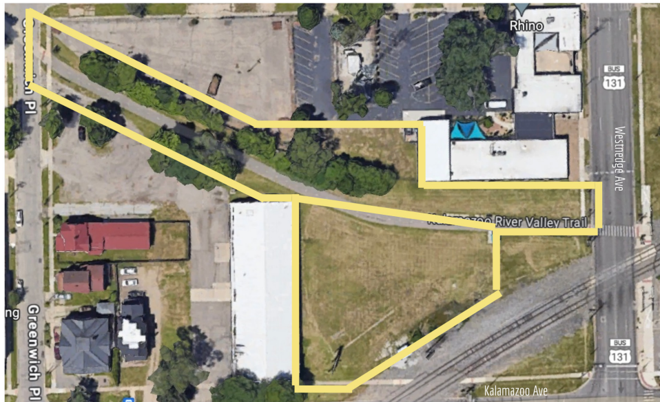
Northwest corner of Kalamazoo and Westnedge Ave

DO YOU WANT TO HELP US TURN THIS PUBLIC SPACE INTO THE HEART OF THE STUART HISTORIC NEIGHBORHOOD