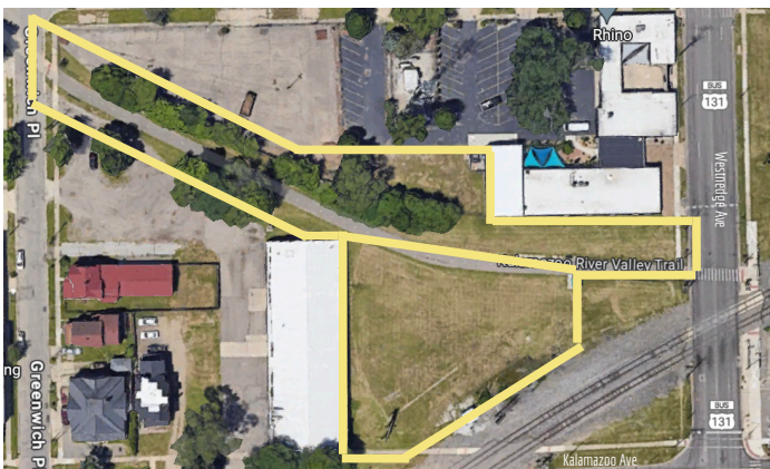
The public space for the KRV T Placemaking Project at the northwest corner of Kalamazoo and Westnedge Ave.

We want to give you three reasons why this project is important to the Stuart neighborhood and why you should register to participate in the KRV T Placemaking Design Workshop for Residents on Saturday, July 20, 10:00 - 2:00 pm at Woodward School . All residents of Kalamazoo are welcome at this workshop. Refreshments and lunch will be provided.