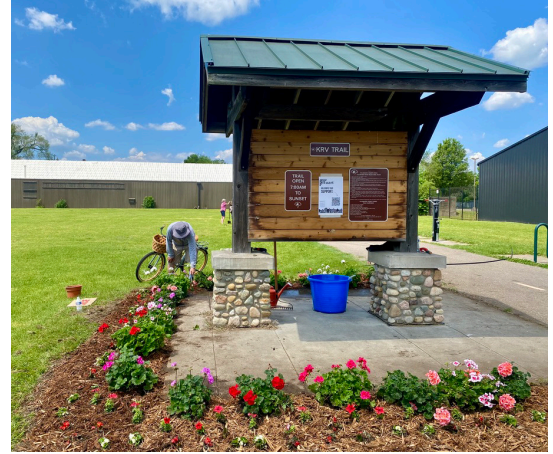
KRVT Trailhead at the corner of Westnedge & Kalamazoo Ave.

The club will warm up together for 15 minutes and encourage participants with similar workout interests to group together and head out for a workout on the the KRVT. The type, length, and intensity of the workout is determined 100% by participants.